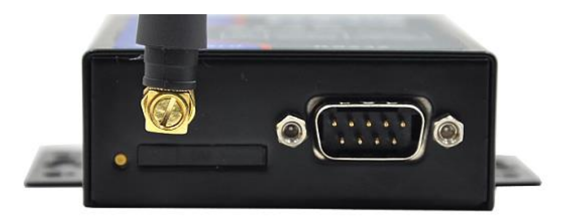
Figure 6 Interface Diagram 2