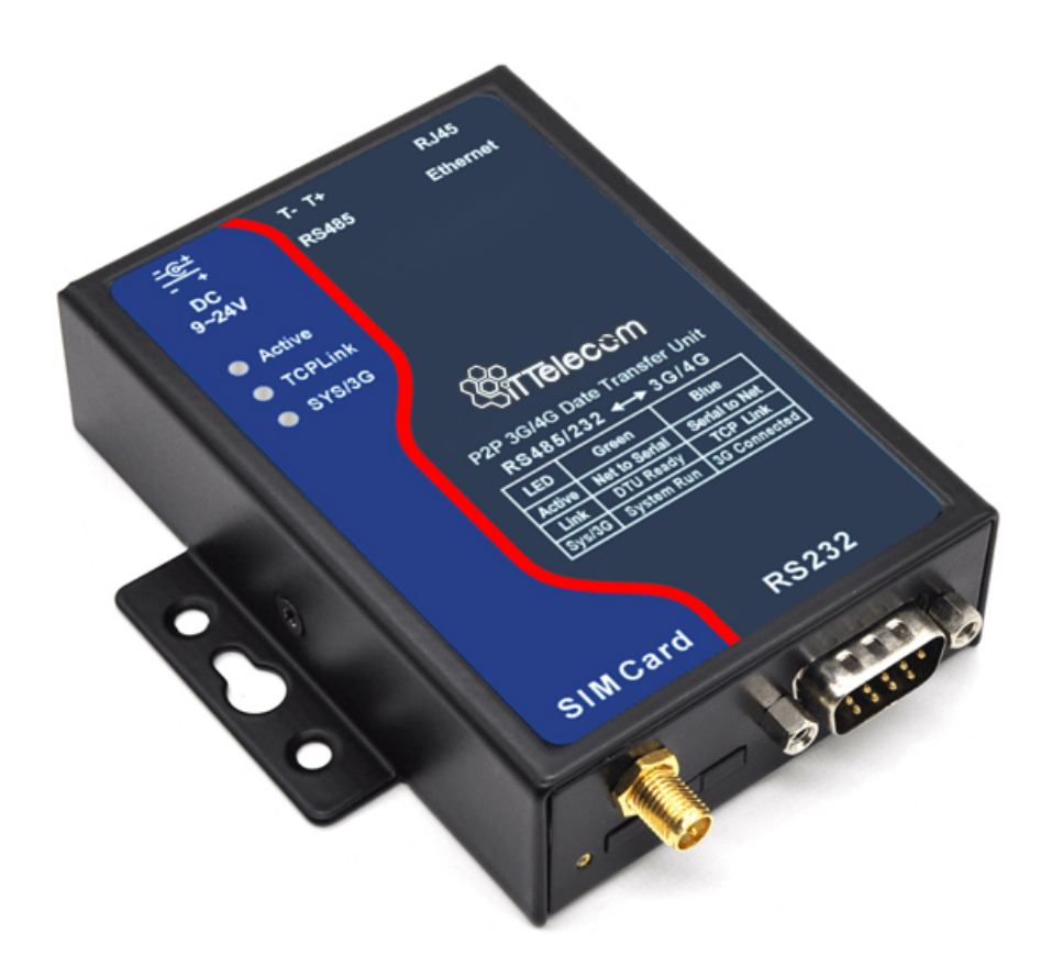
Figure 1 ITT-SR4781 Appearance

ITT-SR4781 is 3G/4G network solutions launched by ITTELECOM. The Serial contain 4: (support Telecom 3G),(Support Modbus TCP Gateway),(Support Mobile and Unicom 3G/4G), (Support P2P). The function of Modbus TCP and P2P can add to models ITT-SR4781.