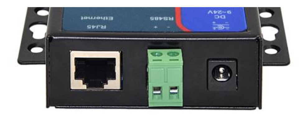
Figure 5 Interface Diagram 1