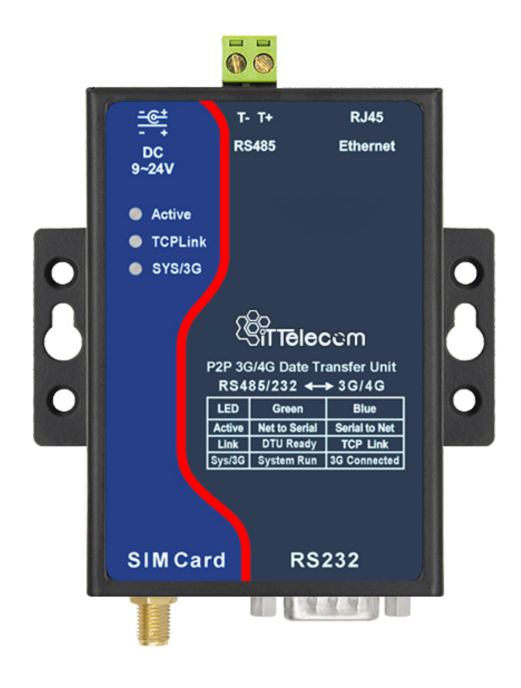
Figure 4: ITT-SR4781 Front View